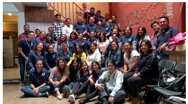
Staff of Urban Mosaic serving in six Mexico City slums.